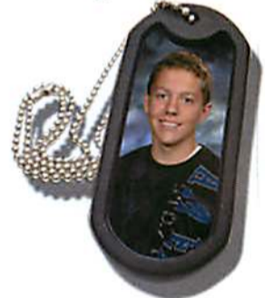
Dog tag Necklace